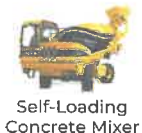
Self-Loading Concrete Mixer